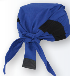
RCS305 - BLUE