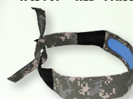
RCS109 - DIGITAL CAMO