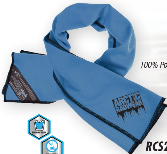
RCS20 - BLUE