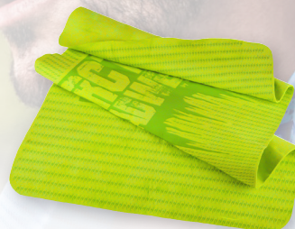
RCS11 - LIME