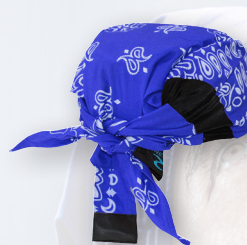
RCS308 - BLUE PAISLEY