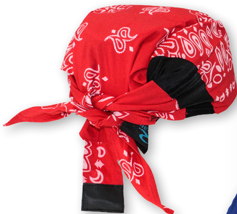
RCS307 - RED PAISLEY

Cooling HeadShade Design is protected under design patent number D746,555 / utility patent 9,241,522