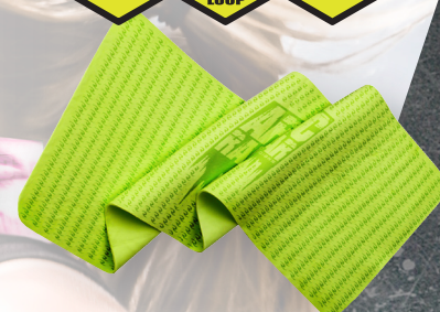
RCS51 - LIME