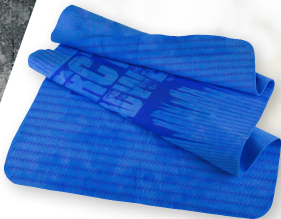
RCS10 - BLUE