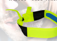
RCS110 - HIGH VISIBILITY LIME