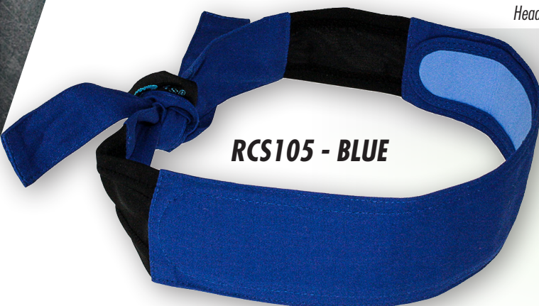
RCS105 - BLUE

Headband Stretch-Fit Design is protected under patent number D712094