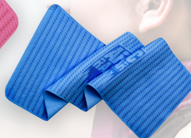
RCS50 - BLUE