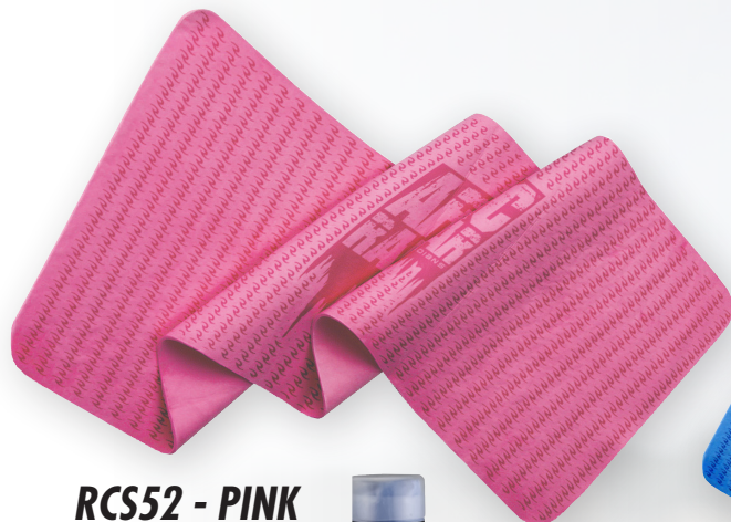
RCS52 - PINK